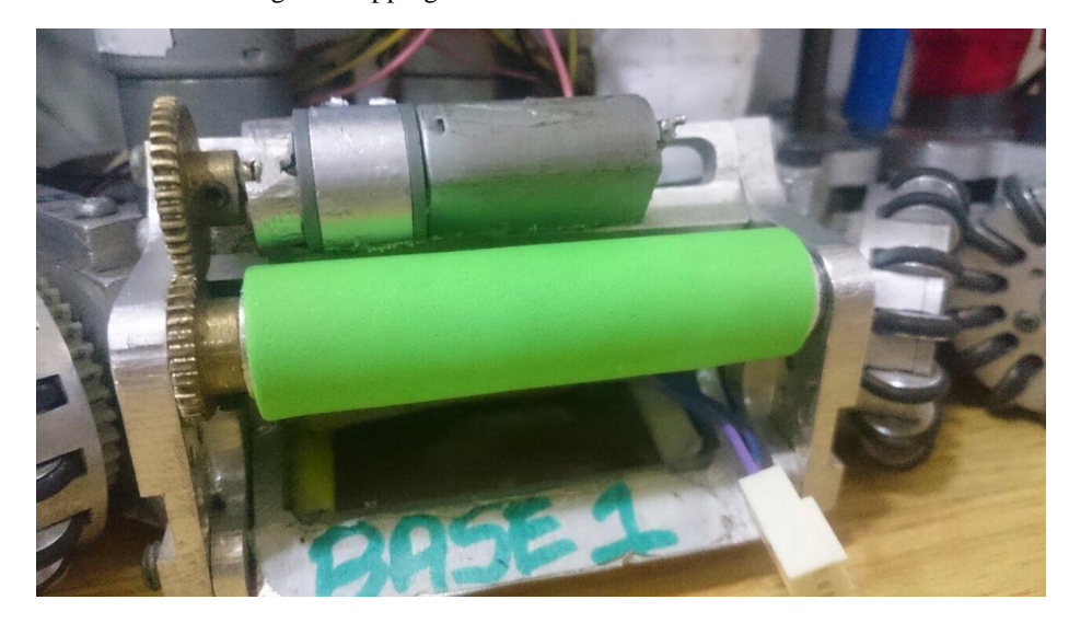
Figure 3.3.1: Chipper and Dribbler Assembly

Till now our robots did not have a chipper tool. This year we've designed the chipper module and are currently in the fabrication process. With the chipper added, we will start with adding the chipping skill to the robot software.